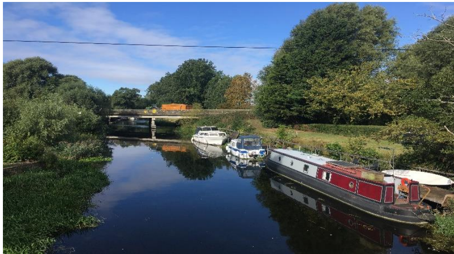
The River Wissey at Hilgay, Norfolk

Welcome to our newsletter for Spring Term 2020. Our schools have been great places to be this term, full of projects and events. As we near the end of term, there are many challenges with health issues across the country for children and staff. We are hoping that you all have a quiet and calm end to term and stay in good health.